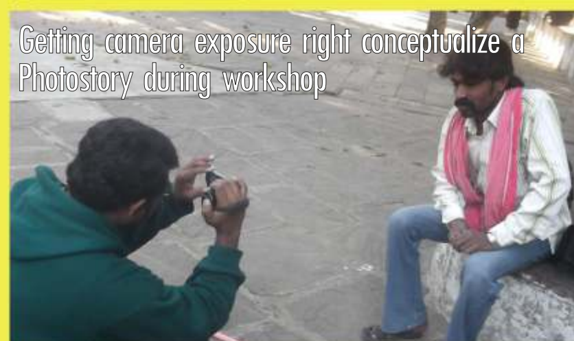
Getting camera exposure right conceptualize a Photostory during workshop