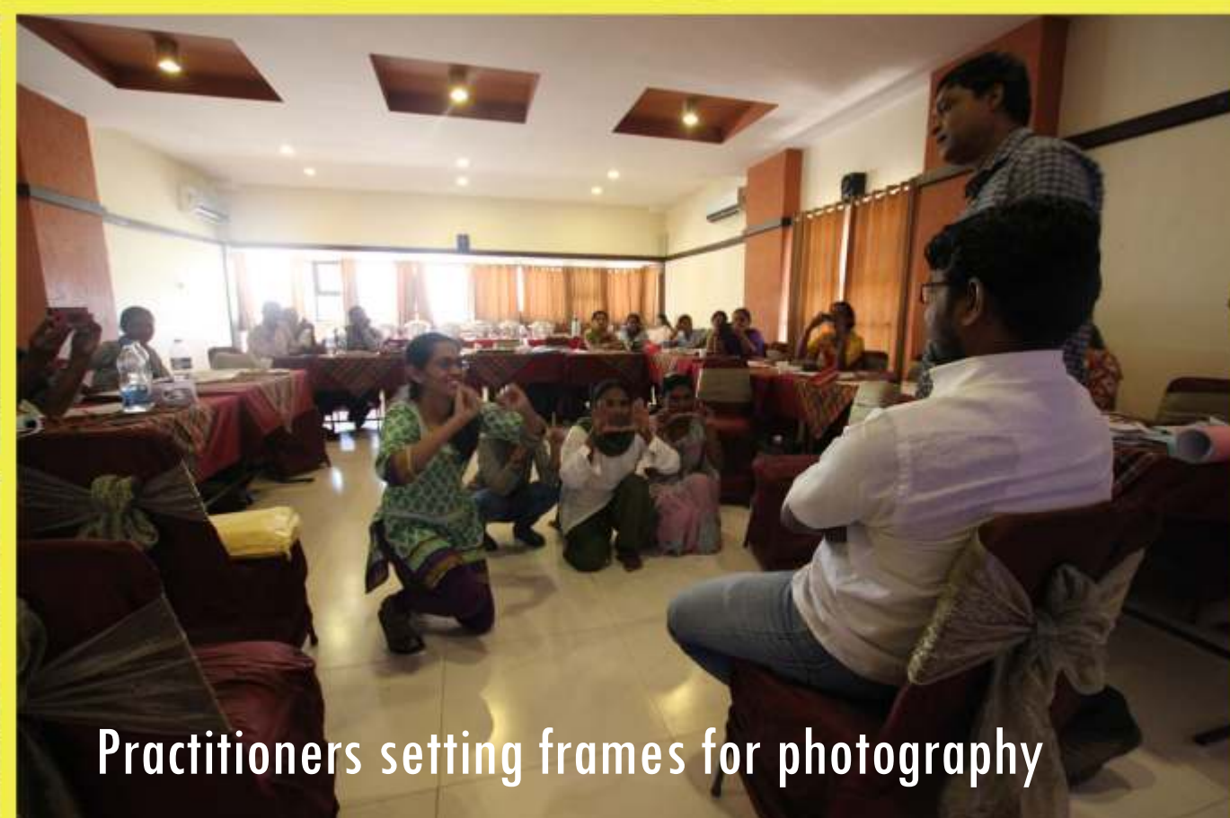
Practitioners setting frames for photography