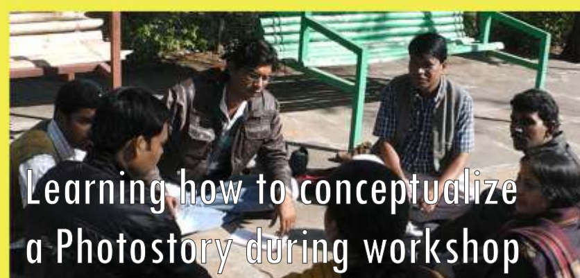
Learning how to conceptualize a Photostory during workshop