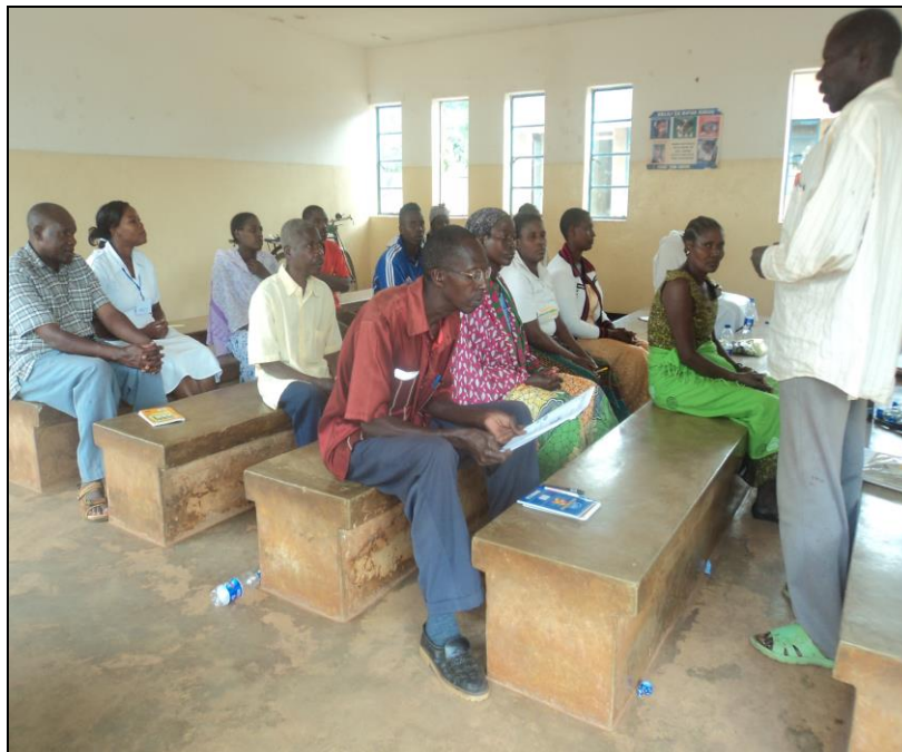
Introduction Session led by the Village Chairperson