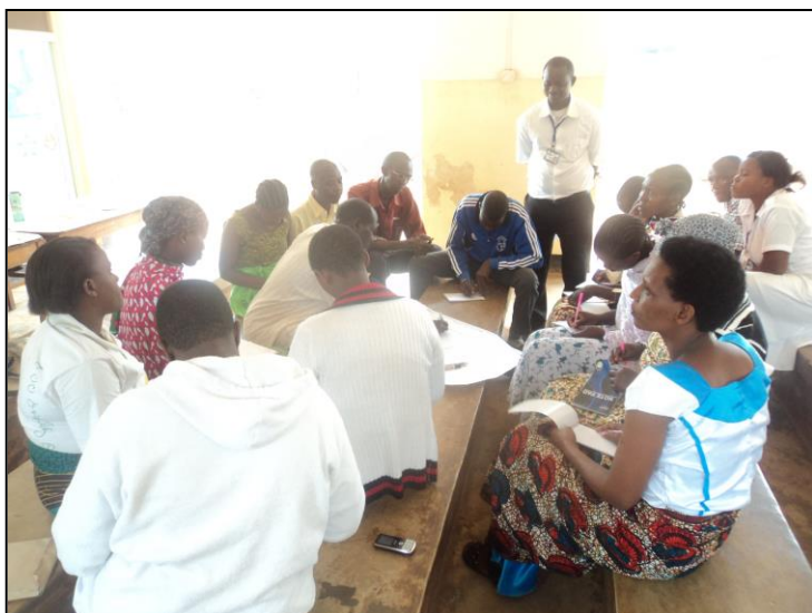
Participants in group discussion

This session involved reviewing Progress Markers which were developed during the Second Community Meeting for the purpose of measuring the trend and quality of FP services in Bukiriro Village from April to June 2014. All participants from all social groups came together in a plenary discussion in which an individual or group had to state the extent of implementation reached in the time period under discussion. In this respect, participants stated whether implementation had been DONE, had STARTED, was ONGOING or NOT DONE. Table 3 below are the progress markers after being reviewed by all participants: