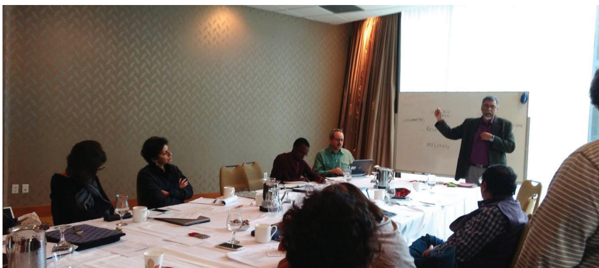
COPASAH Convener setting the tone for the discussion

strengthen the work that has begun. The latent fear one has is that in the name of evidence based practice there may be an inclination to under-value and delegitimize the rich community based experiences, knowledge and practices that keep the health of the community intact. In the pursuit of scalable solutions, the unique contexts in which marginalization takes place and the varied dimensions of empowerment could stand to be ignored. Taken together this can further lead to instrumental participation of the community without a sufficient shift in the ‘power balance’ between state authorities and the communities.” He further added, “Through COPASAH one can find more effective ways of building capacity and sharing grounded practice, as well as build knowledge from practice as well. Considering the current trends, it is important to also influence the global policy processes that are talking of social accountability and citizen engagement, but not necessarily investing enough in community empowerment processes, nor in installing effective governance mechanisms.”