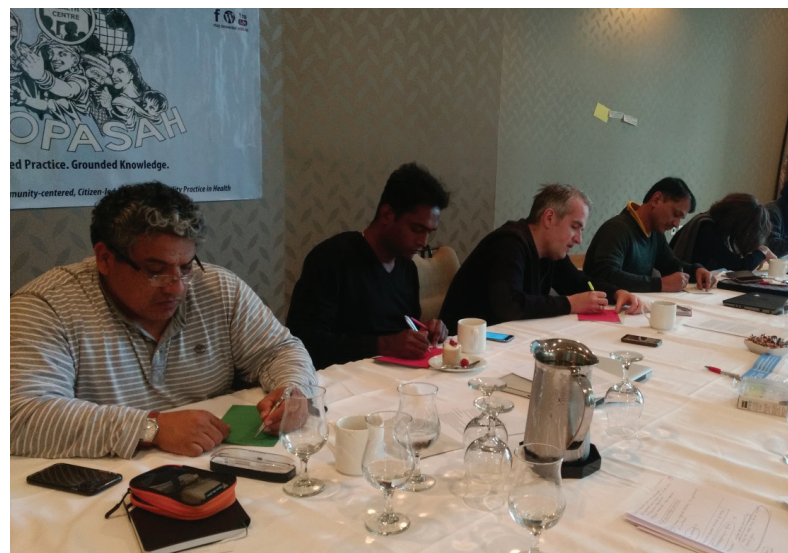
Participants keying in thoughts in the strategizing exercise