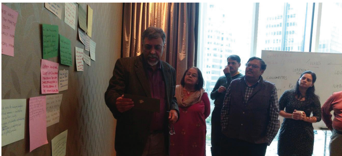
Members deliberating on clusters