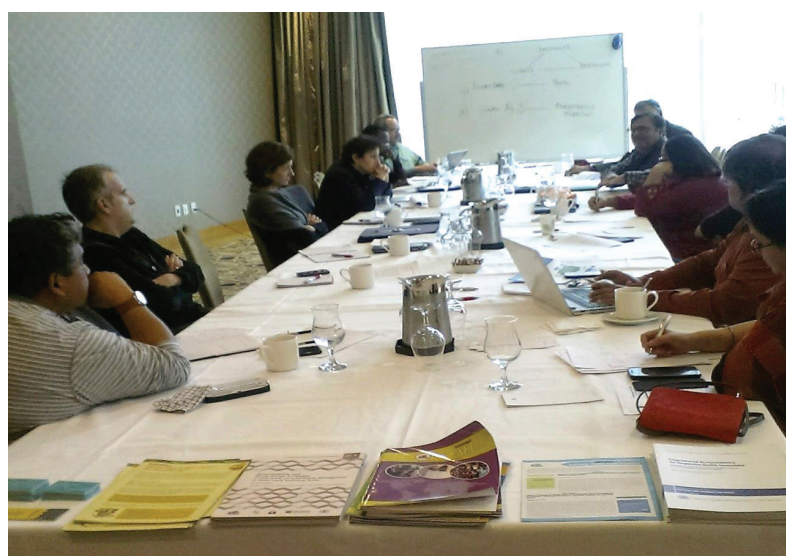
Round Table Discussion on the social accountability ecosystem, challenges and opportunities