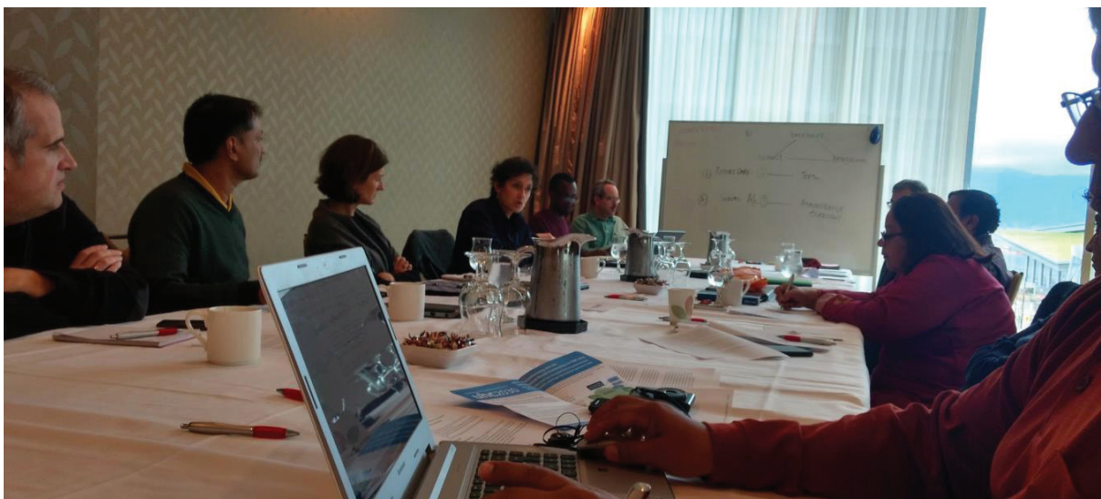
Participants Discussing the Contours of Social Accountability