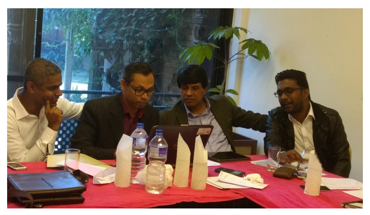
Srilanka team deleiberating on the way forward

The team members also opined that health sector coalitions exist apart from health sector unions and are pursuing work on accountability, there is a need to bring them together.