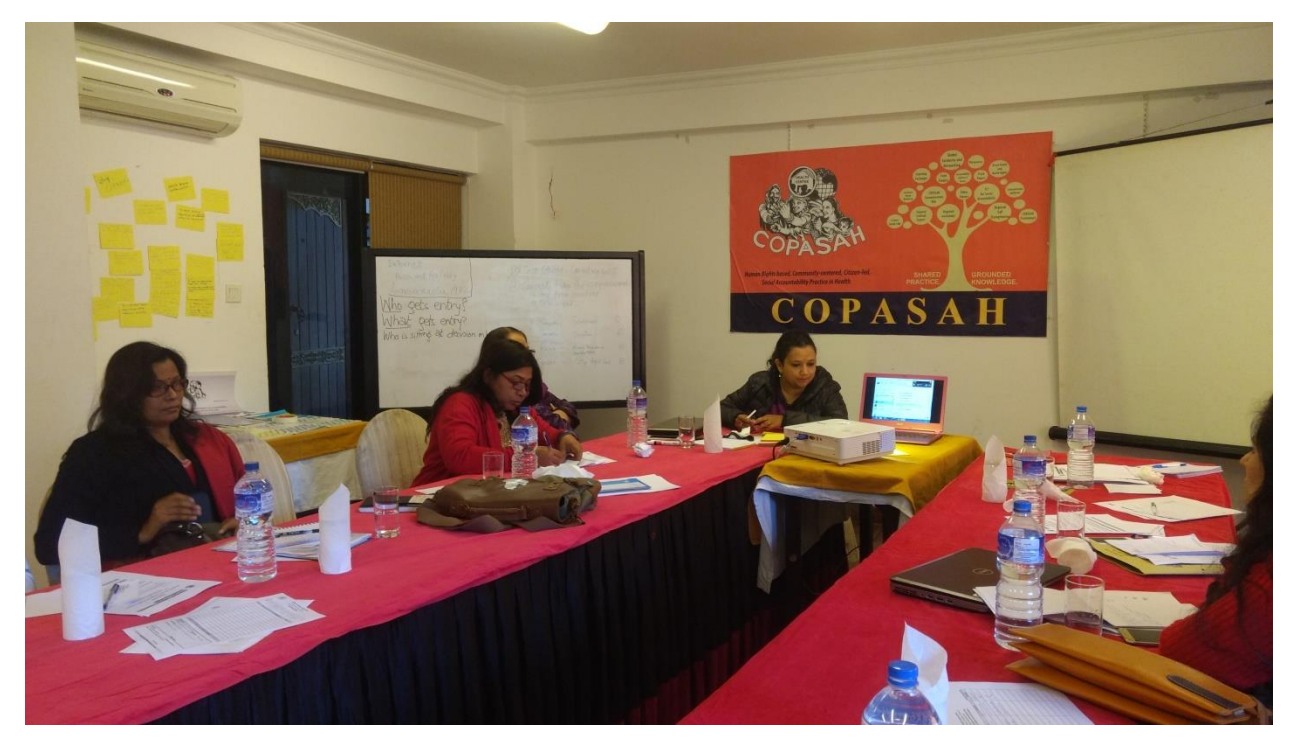
Participants seeking queries on private sector accountability on Skype

medical activists. The focus is on the rational treatment protocols, where patients are not stuck in medical consumerism.