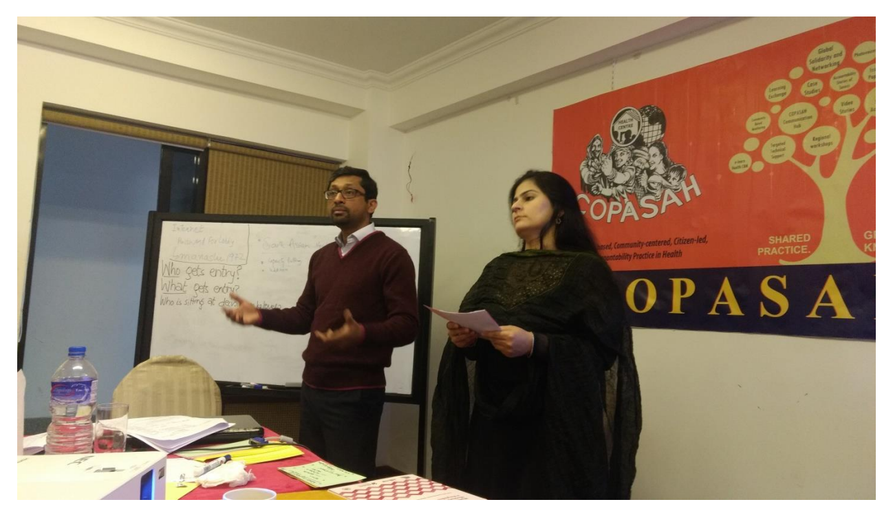
Pakistan team sharing plans for way forward

The Pakistan team delineated that they would endeavor to expand the already existing network of COPASAH in the country. They added that different social accountability networks exist in the country which are working on social accountability and include a gamut of donors and numerous NGOs, for example PASN, EVA BHN (£5 million donor funded venture). The team added that these networks would be approached for interaction along with different stakeholders such as medical associations, consumer protection organisations and these would be linked with COPASAH.