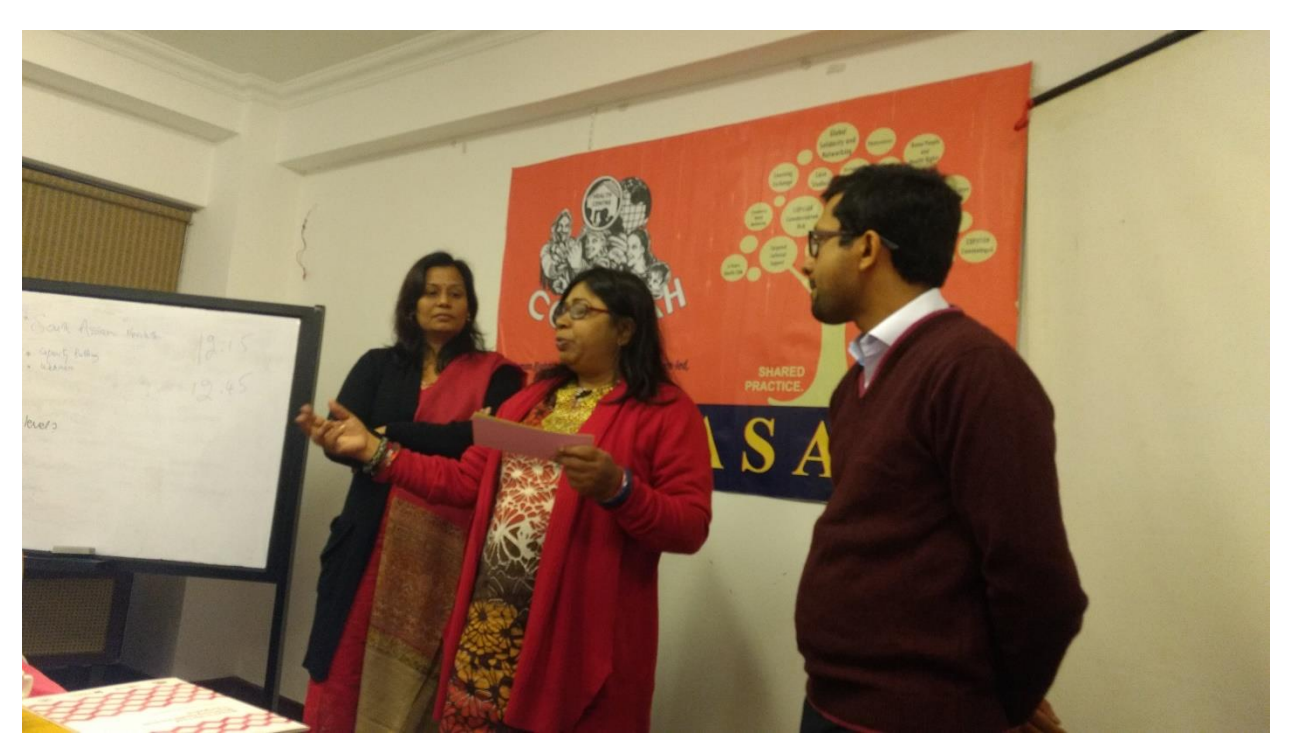
Bangladesh team sharing the Plan for taking COPASAH ahead

i) Enthused by the discussion on the social accountability of the session on the private medical sector, Bangladesh participants reflected that they would be keen on collating more information on the private medical sector in the country.