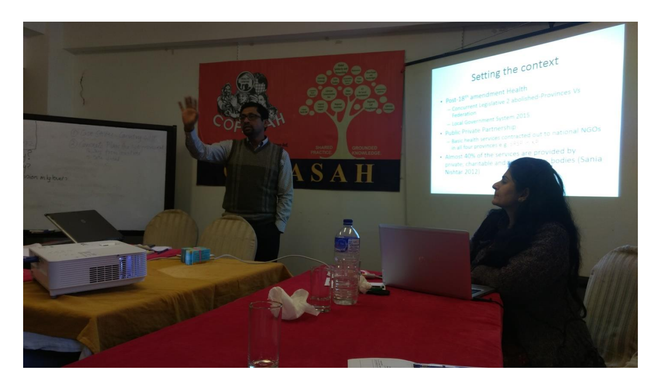
Pakistan team members sharing country accountability context

accountability have gained political support in the recent times. There have been recent legislations on guaranteeing public services, information, accountability, conflict of interest etc. Different accountability structures exist in the country in form of Public Accounts Committee, National Accountability Commission, Public Procurement Regulatory Authority, Auditor General of Pakistan, Tasks Forces of PM, CM and other officials, Anti-Corruption Establishments, Federal Investigation Authority and Independent Monitoring Units. Different Social Accountability mechanisms have been employed in the provinces as well since 1990s including the School Management Committees (SMCs)-1994, Parent Teacher Associations/Committees(PTAs/PTCs)-1994, Health Management Committees and Primary Care Management & Secondary Care Management Committees -2001.