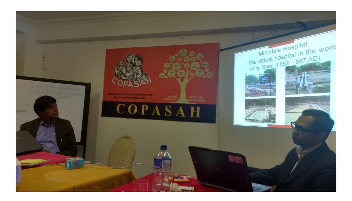
Srilanka team presenting country context

However despite overall health figures, there are huge variations within the country. Food security remains a huge issue with 1/3^{rd} of children being malnourished. The ageing population is high and the country is witnessing socio-economic transition. The country is also observing an increase in the non –communicable diseases, amongst which 20% accounts for share in the non-communicable diseases and chronic kidney diseases form a major burden now in the country. The health services are delivered through an extensive network of primary-to-tertiary level health institutions and the Ministry of Health, Nutrition and Indigenous Systems is the central government ministry responsible for health, providing both allopathic and Ayurveda services.