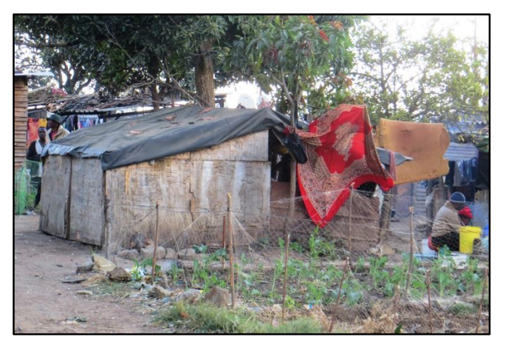
Life in Cassa Banana